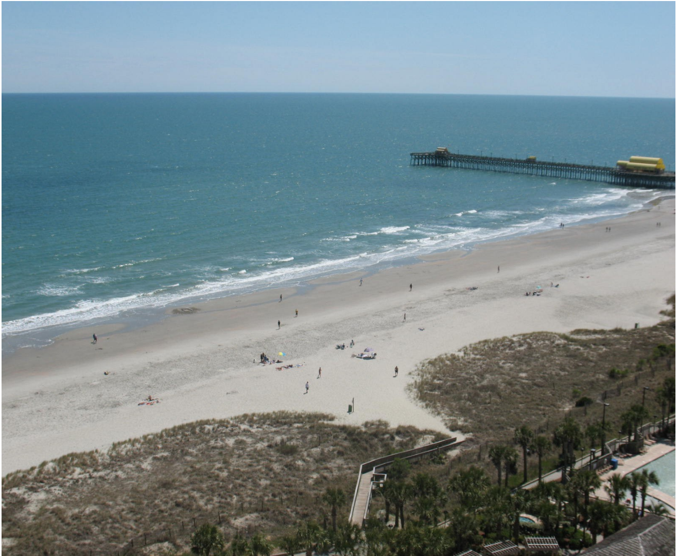
Back Photo: Myrtle Beach, April 2010 Front Photo: Sikes Hall, Clemson SC